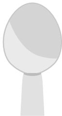
Soup Spoon Attachment