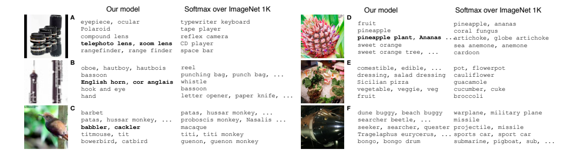
Figure 2: For each image, the top 5 zero-shot predictions of DeViSE+1K from the 2011 21K label set and the softmax baseline model, both trained on ILSVRC 2012 1K. Predictions ordered by decreasing score, with correct predictions in bold. Ground truth: (a) telephoto lens, zoom lens; (b) English horn, cor anglais; (c) babbler, cackler; (d) pineapple, pineapple plant, Ananas comosus; (e) salad bar; (f) spacecraft, ballistic capsule, space vehicle.