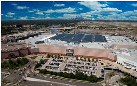
Mall of America aerial view