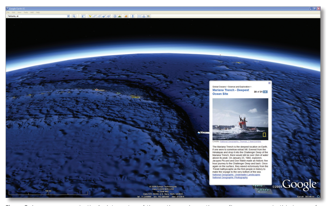
Figure 2: Layer your organization's data on top of the earth – and now the sea floor – as seen in this image of the Marianas Trench.

Go beyond Earth In addition to the Earth, Google now allows users to view data about the Oceans – and even the Moon and Mars. Google Earth also lets you "go back in time" with the ability to view historical imagery, comparing it with present day views help employees quickly understand how a place or region has evolved over time.