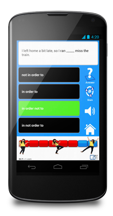
Eltsoft's 'English Grammar Free' app