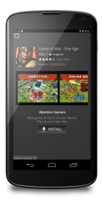
Eltsoft's full-page interstitial ad