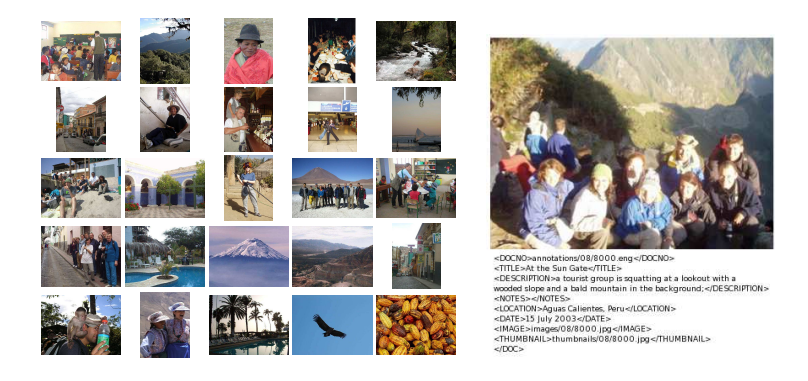
Fig. 2. Sample IAPR data. On the left are 25 randomly selected images from the dataset. On the right is a single image and its associated annotation. Noun extraction from the caption provides keywords for annotation.