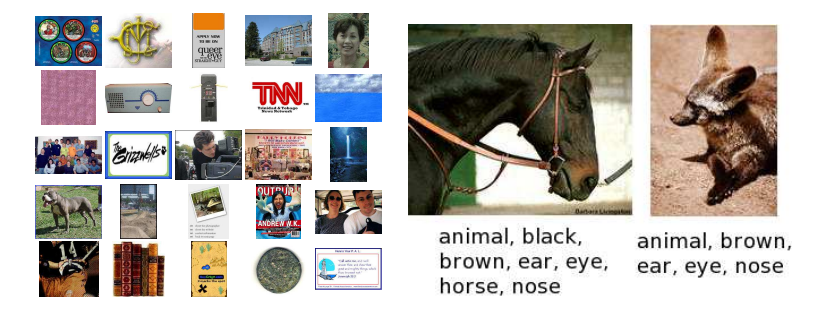
Fig. 3. Sample ESP data. On the left are 25 randomly selected images from the dataset, while on the right are two images and their associated keywords. These images are quite different in appearance and content, but share many of the same keywords.

For the IAPR TC-12 and ESP datasets, we have made public the dictionaries, as well as the training and testing image set partitions, used in our evaluations<sup>7</sup>. On all three annotation datasets, we evaluated the performance of a number of baseline methods. For comparisons on Corel5K, we summarized published results of several approaches, including the most popular topic model (i.e. CorrLDA [4]), as well as MBRM [9] and SML [2], which have shown state-of-the-art performance on Corel5K. On the IAPR TC-12 and ESP datasets, where no published results of annotation methods are available, we compared the performance of our baseline methods against MBRM [9] which was relatively easier to implement and had comparable performance to SML [2]<sup>8</sup>.