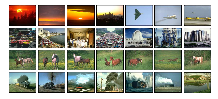
Fig. 5. Retrieval results using JEC on Corel5K. Each row displays the first seven images retrieved for a query. From top to bottom, the queries are: sky, street, mare, train.

all five performance measures. One reason for this exceptional performance may be due to the use of a wide spectrum of different features, contributing along different "orthogonal" factors. This also points to the well-understood inadequacies and limitations of most image representation models that rely on individual or small subsets of features. Figure 4 shows some images annotated using the JEC baseline. Additionally, we show some retrieval examples using the JEC baseline in Fig. 5.