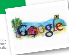
2007 winner, Australia