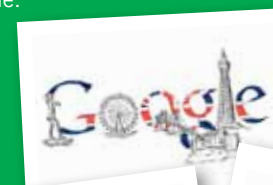
2006 winner, UK

The winning entry will be displayed on the Google Australia homepage for a day to be viewed by millions of people.