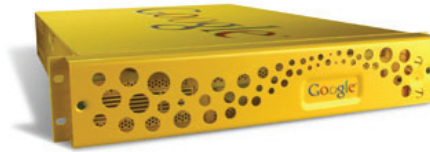
Figure 4 - Google Search Appliance - ten million docs in a box

As a counterpoint, Kimberly-Clark addressed their entire internal search needs with a few simple GSA boxes, each of which looks like this: