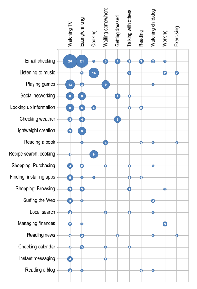
Figure 3. Frequency of top tablet activities by top secondary activities.

The most frequently reported non-tablet activities that participants were doing at the same time they were using their tablet were: Watching TV, eating or drinking, cooking, waiting somewhere, getting dressed, talking with others, and exercising, among others (see Table 3 for more details for each). Those tablet activities that included secondary activities were: Listening to music, checking the weather, checking and light responding to emails, recipe search and cooking, social net-