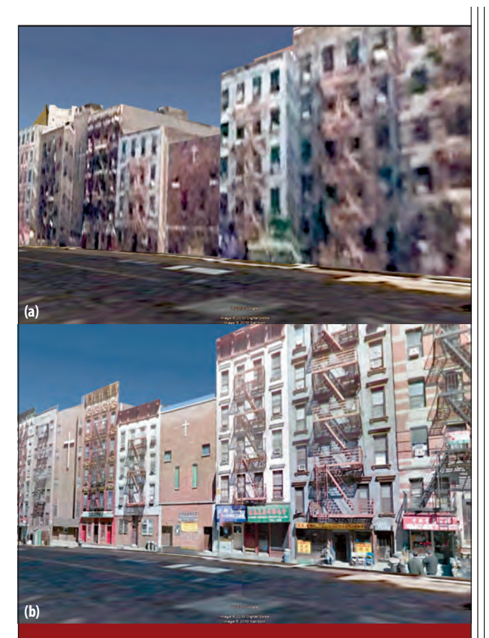
Figure 8. Using Street View data to enhance user walkthrough experiences in Google Earth. (a) Original 3D models of a New York City scene from airborne data only. (b) Fused 3D model with high-resolution facades. The visual quality is considerably higher, and many storefronts and signs can now be easily identified and recognized.

A. Frome et al., "Large-Scale Privacy Protection in Google Street View," Proc. 12th IEEE Int'l Conf. Computer Vision (ICCV 09), IEEE Press, 2009; http://research.google.com/ archive/papers/cbprivacy_iccv09.pdf.