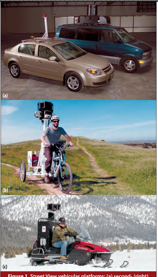
Figure 1. Street View vehicular platforms: (a) second- (right) and third- (left) generation custom road vehicles; (b) Trike; (c) modified snowmobile.

In parallel with the road vehicles, the Street View team has developed numerous special data-collection platforms. We created the Trike to quickly record pedestrian routes in both urban and rural environments. It has been used everywhere from Legoland to Stonehenge, and is currently collecting data on UNESCO World Heritage sites. More recently, a snowmobile-based system was developed to capture the 2010 Winter Olympics sites in Vancouver. Aside from the obvious mechanical differences, it's essentially a Trike without laser scanners. This spring,