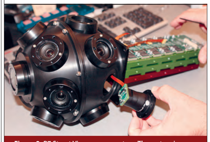
Figure 2. R7 Street View camera system. The system is a rosette (R) of 15 small, outward-looking cameras using 5-megapixel CMOS image sensors and custom, low-flare, controlled-distortion lenses.

the R5 system—the fifth generation of a series that we developed in-house, all of which provide high resolution compared to the "lite" vehicles' off-the-shelf camera. We're currently manufacturing and deploying its successor, R7.