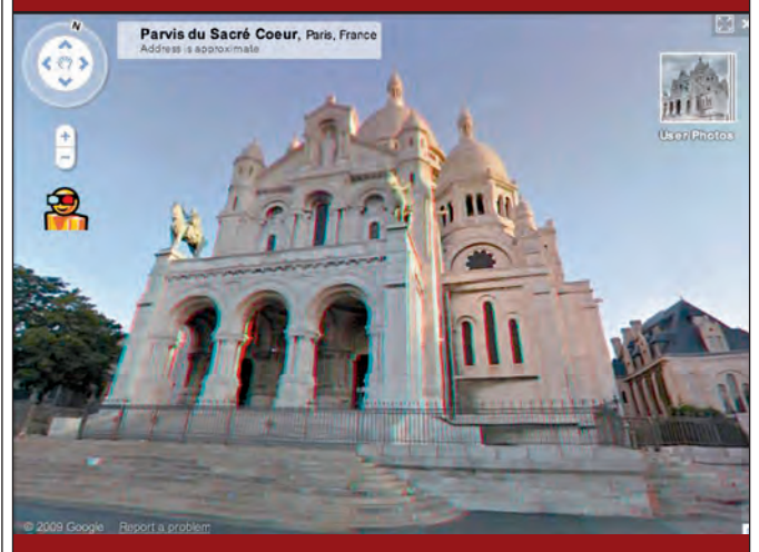
Figure 7. Panoramic 3D anaglyphs let users experience depth in Street View with simple red-cyan eyeglasses. Known depth is used to synthesize binocular parallax on the client side, thereby creating a second displaced view that replaces the red color channel in the original view.

Figure 6. Depth map. Once the facade model is generated using lasers or computer vision, it's possible to render a panoramic depth map by tracing rays from each panorama position. Each pixel in the depth map represents a lookup into a table of 3D plane equations, which enables the client code to reconstruct the real depth values at runtime.